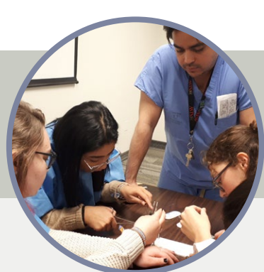
Discovery Days Dalhousie University

“Loved every minute of it. For sure would recommend it if you are not quite sure what you want to do in the sciences.” Student, University of Manitoba event