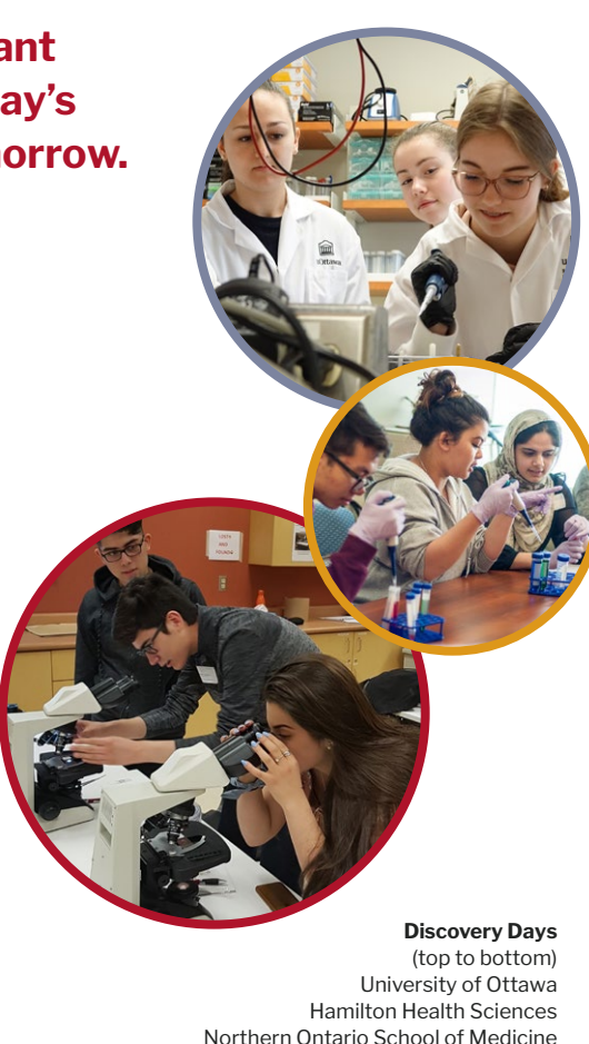
Discovery Days (top to bottom) University of Ottawa Hamilton Health Sciences Northern Ontario School of Medicine

“I'm really grateful for this opportunity and it really helped me explore this field and guided my choices for my post-secondary education. All the people hosting the workshops were very knowledgeable and helpful and they really inspired me to pursue health sciences.” Student, McGill University, The Neuro event